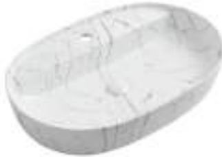
HB2TT - 474 600 X 400 X 130