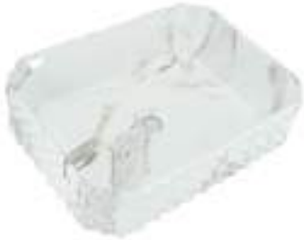
HBITT - 446 505 X 380 X 135