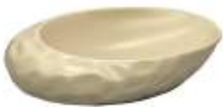
HBITT - 238 520 X 320 X 140