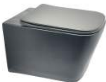
HB1WH - 1001