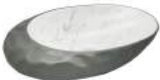
HBITT - 241 520 X 320 X 140