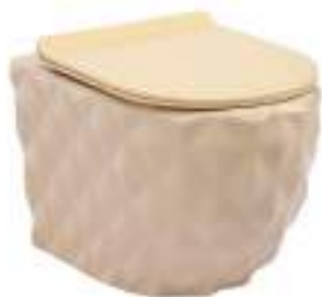
HB1WH - 1020