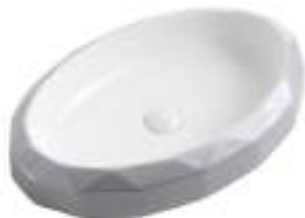
HB2TT - 938 600 X 400 X 125