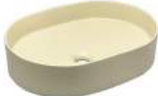
HBITT - 311 500 X 370 X 130