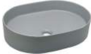
HBITT - 308 500 X 370 X 130