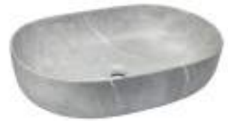
HBITT - 333 600 X 420 X 150