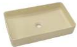
HBITT - 379 610 X 330 X 110