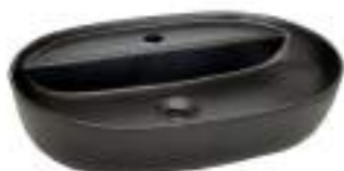
HBITT - 280 600 X 420 X 150