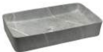
HBITT - 417 610 X 330 X 110