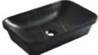
HB1TT - 506 600 X 380 X 145