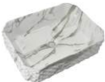
HBITT - 408 505 X 380 X 135