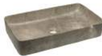
HBITT - 419 610 X 330 X 110