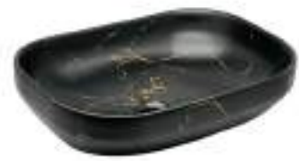
HBITT - 451 510 X 400 X 140