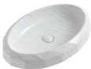
HB2TT - 942 600 X 400 X 125