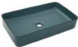
HBITT - 181 610 X 330 X 110