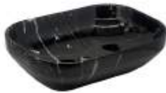
HBITT - 452 510 X 400 X 140