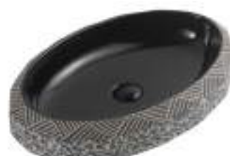
HB2TT - 936 600 X 400 X 125