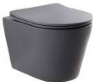
HB1WH - 1008