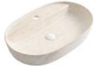
HB2TT - 471 600 X 400 X 130