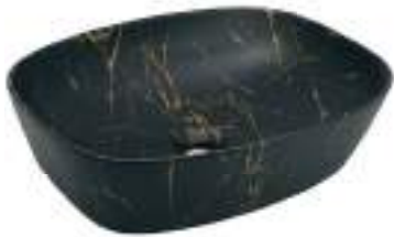
HBITT - 488 500 X 390 X 140