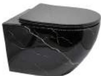
HB1WH - 1023