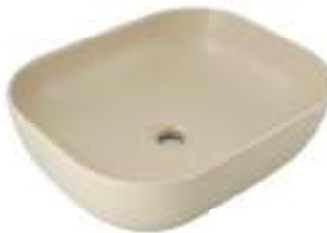
HBITT - 397 500 X 390 X 140