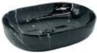
HBITT - 331 600 X 420 X 150