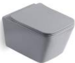
HB2WH - 1142