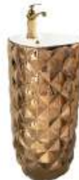
HB2FS - 1002 410 X 410 X 820