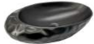
HBITT - 237 520 X 320 X 140