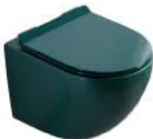
HB1WH - 1009