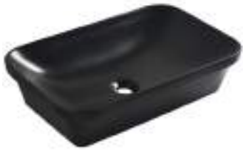
HB1TT - 502 600 X 380 X 145