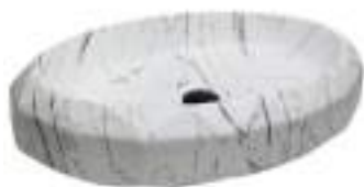
HB2TT - 946 600 X 400 X 125