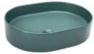
HBITT - 309 500 X 370 X 130