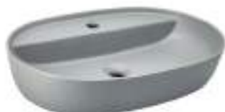
HBITT - 281 600 X 420 X 150