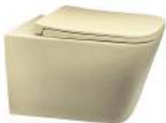
HB1WH - 1019