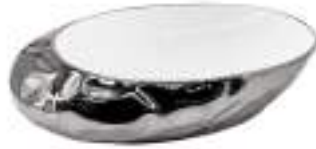
HBITT - 236 520 X 320 X 140