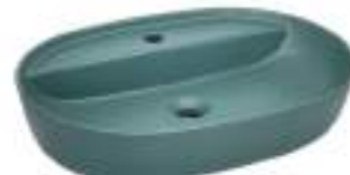
HBITT - 282 600 X 420 X 150