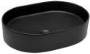
HBITT - 307 500 X 370 X 130