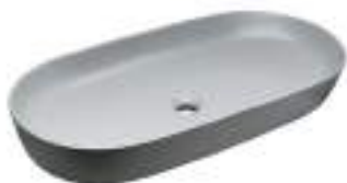
HBITT - 233 810 X 410 X 130