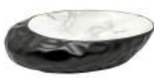
HBITT - 242 520 X 320 X 140