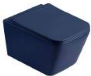
HB2WH - 1145