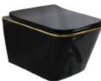
HB1WH - 1031