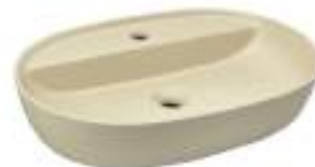
HBITT - 357 600 X 420 X 150