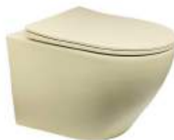
HB1WH - 1018