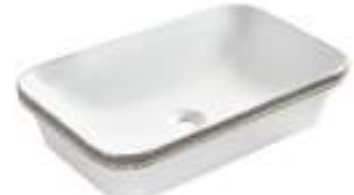
HB1TT - 509 600 X 380 X 145