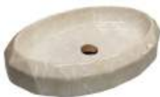
HB2TT - 943 600 X 400 X 125