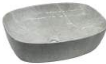
HBITT - 487 500 X 390 X 140