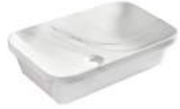
HB1TT - 504 600 X 380 X 145