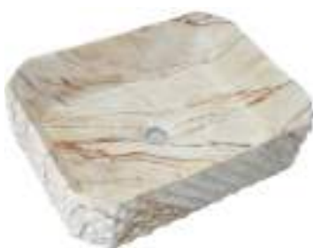
HBITT - 409 505 X 380 X 135