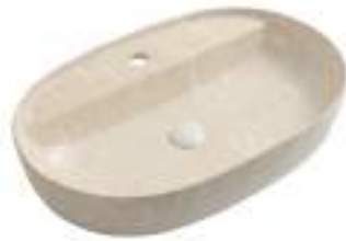
HB2TT - 470 600 X 400 X 130