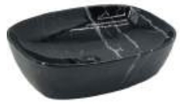
HBITT - 486 500 X 390 X 140