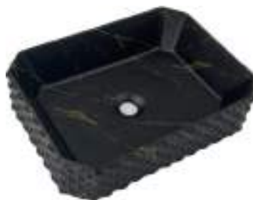
HBITT - 410 505 X 380 X 135