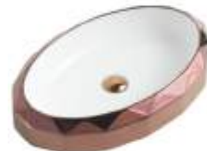
HB2TT - 939 600 X 400 X 125