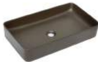
HBITT - 182 610 X 330 X 110