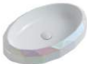
HB2TT - 937 600 X 400 X 125