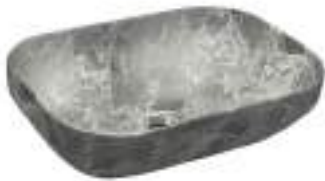
HBITT - 453 510 X 400 X 140