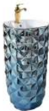
HB2FS - 1005 410 X 410 X 820