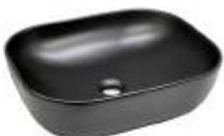
HBITT - 395 500 X 390 X 140