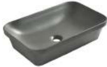
HB1TT - 503 600 X 380 X 145