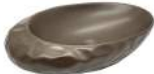
HBITT - 239 520 X 320 X 140