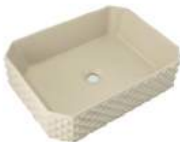
HBITT - 406 505 X 380 X 135