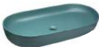
HBITT - 234 810 X 410 X 130