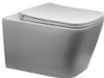
HB1WH - 1002