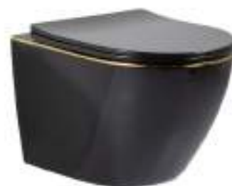
HB1WH - 1033