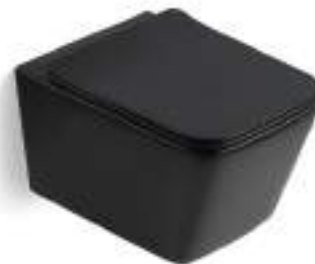
HB2WH - 1144