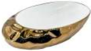
HBITT - 235 520 X 320 X 140