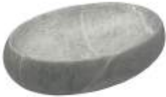
HBITT - 430 600 X 400 X 150