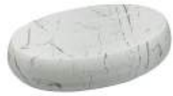
HBITT - 432 600 X 400 X 150