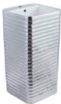
HBFS - 1009 400 X 400 X 830