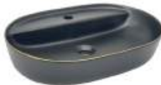
HBITT - 292 600 X 420 X 150