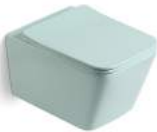
HB2WH - 1143