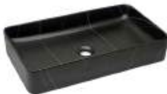
HBITT - 418 610 X 330 X 110