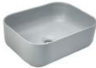
HBITT - 155 400 X 300 X 140