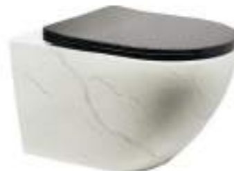
HB1WH - 1021