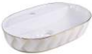
HBITT - 277 600 X 420 X 150