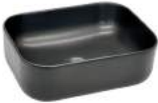
HBITT - 154 400 X 300 X 140