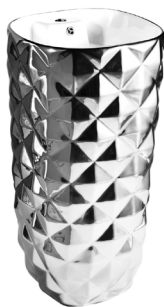
HB2FS - 1004 410 X 410 X 820