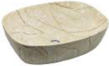
HBITT - 491 500 X 390 X 140