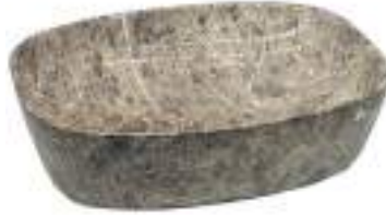
HBITT - 490 500 X 390 X 140