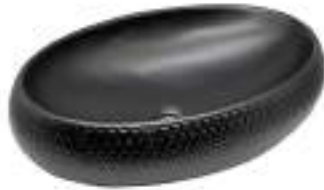
HBITT - 426 600 X 400 X 150