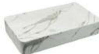
HBITT - 423 610 X 330 X 110