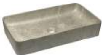
HBITT - 420 610 X 330 X 110