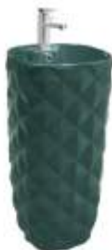
HBFS - 1006 410 X 410 X 820