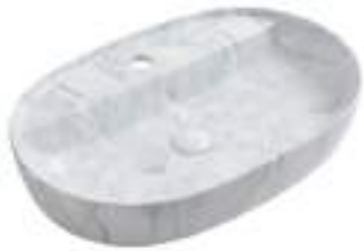
HB2TT - 469 600 X 400 X 130