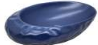
HBITT - 240 520 X 320 X 140