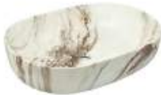
HBITT - 335 600 X 420 X 150