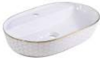
HBITT - 278 600 X 420 X 150