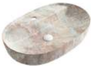
HB2TT - 472 600 X 400 X 130