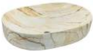
HBITT - 334 600 X 420 X 150