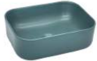
HBITT - 156 400 X 300 X 140