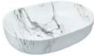
HBITT - 332 600 X 420 X 150