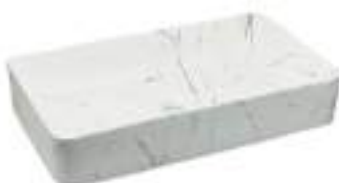
HBITT - 421 610 X 330 X 110