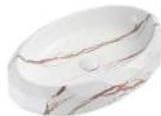
HB2TT - 945 600 X 400 X 125