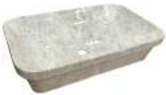
HB1TT - 505 600 X 380 X 145