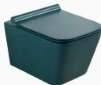
HB1WH - 1003