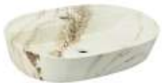
HBITT - 285 600 X 420 X 150