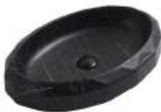
HB2TT - 947 600 X 400 X 125