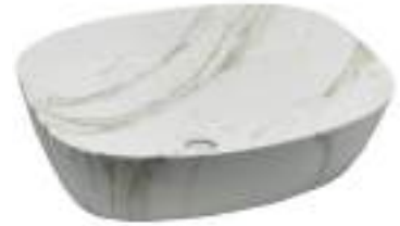
HBITT - 489 500 X 390 X 140