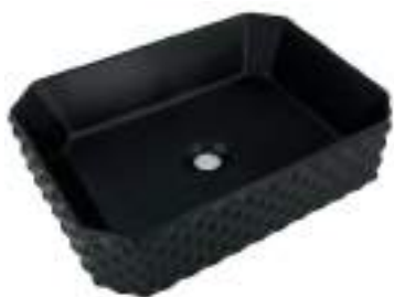
HBITT - 405 505 X 380 X 135