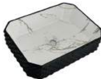
HBITT - 407 505 X 380 X 135