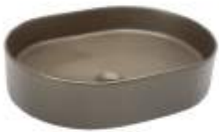
HBITT - 310 500 X 370 X 130