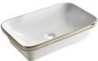
HB1TT - 511 600 X 380 X 145