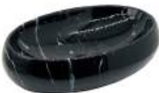
HBITT - 433 600 X 400 X 150