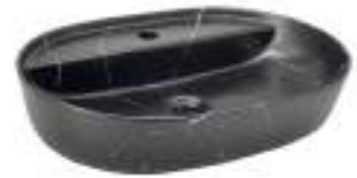
HBITT - 284 600 X 420 X 150